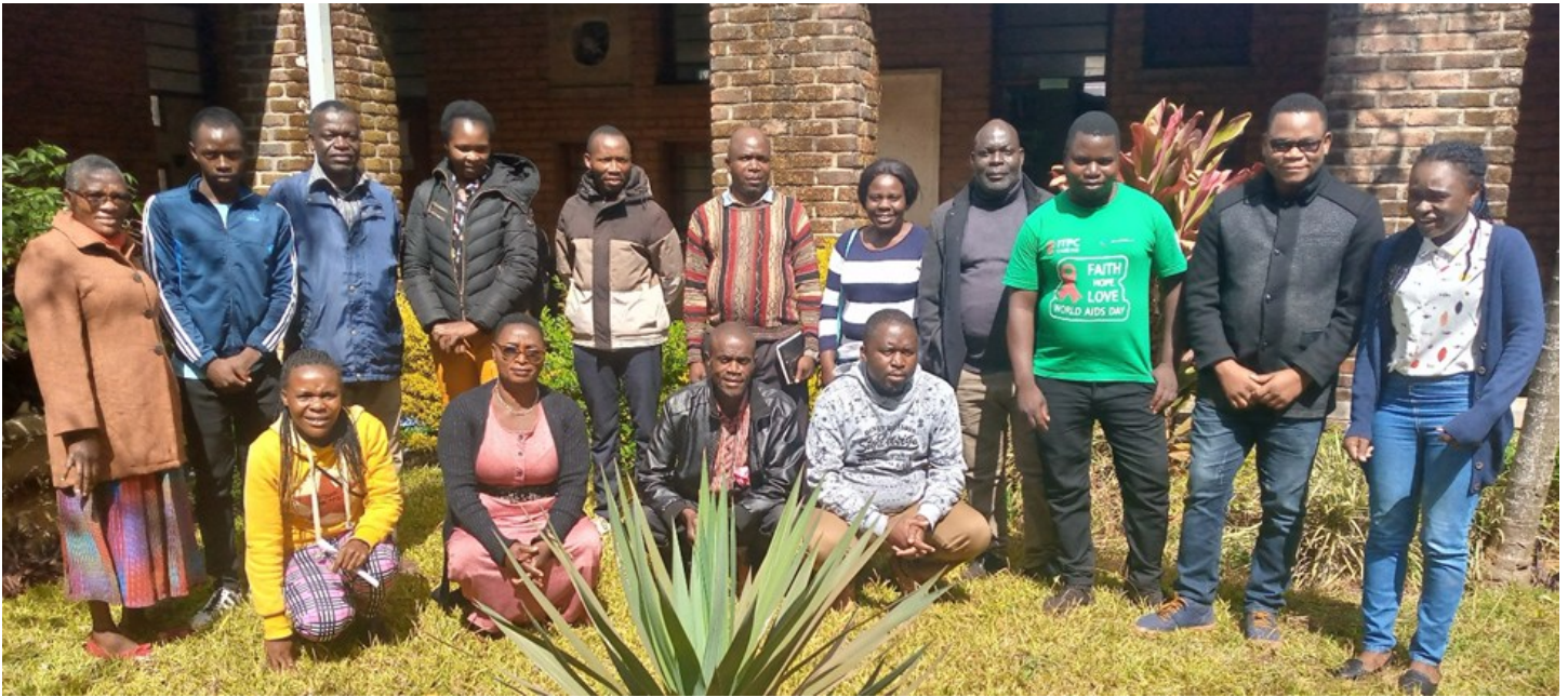
Dedza CCG members pose for a photo after the meeting